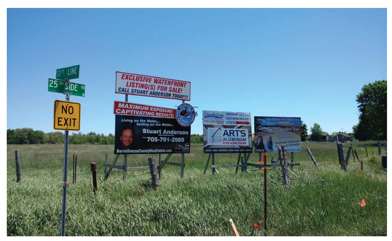
Figure 1. Innisfil, June 2016.

As a result, low density sprawl and large-scale development has continued to proliferate across the county.