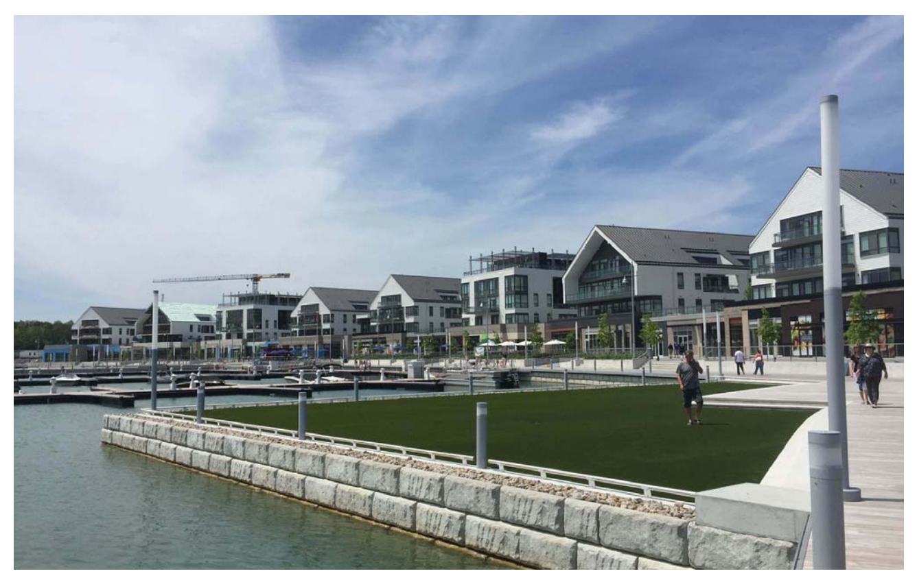
Figure 3. Friday Harbour Resort boardwalk and condos, June 2018.