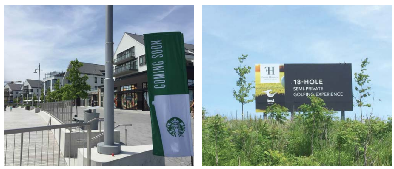
Figure 4. Boardwalk, June 2018.