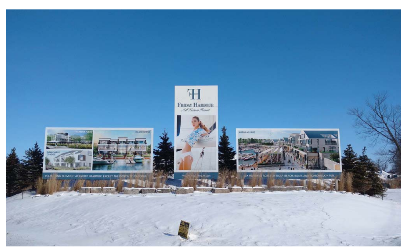
Figure 2. Friday Harbour Resort development site, February 2016.

(Jonas and Wilson 1999, p. 3). This is not uncommon in growing peripheries, where the transformation of land from rural to urban comes with high financial return and significant "development gains," such as development charges or taxes (Harris and Lehrer 2018, p. 25). Friday Harbour includes many development gains for the town of Innisfil, including building permit fees, development charges and municipal taxes (Vanderlinde 2012). The developer also financed new wastewater and sewage infrastructure to service the resort. This infrastructure is available for up to 1,700 nearby homes and cottages to get off private septic systems, should individual households choose to do so. In 2018, the resort committed a further $5 million for a "Health and Wellness Centre", a fire boat, and a capital facility in what was defined as "essentially a public-private partnership deal" by Innisfil's chief administrative officer (Ramsay 2018b, n/p).