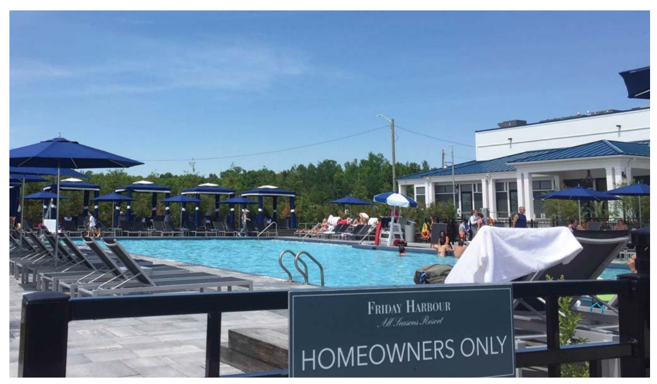
Figure 6. Beach Club, June 2018.

with a publicly accessible all-seasons resort, the development is justified as an improvement to Lake Simcoe's waterfront and an enhancement in accessibility. There is an important argument to be made for improving access to natural amenities and rural spaces in the pursuit of more democratic and low-carbon forms of leisure (Cohen 2014), as well as for decreasing barriers to accessibility. However, accessibility must be measured against the other conditions and factors that shape publicness. The publicness of Friday Harbour's publicly accessible spaces are regulated and conditioned through various factors I will discuss below, including governance, built form and design, and the branding and programming of the resort.