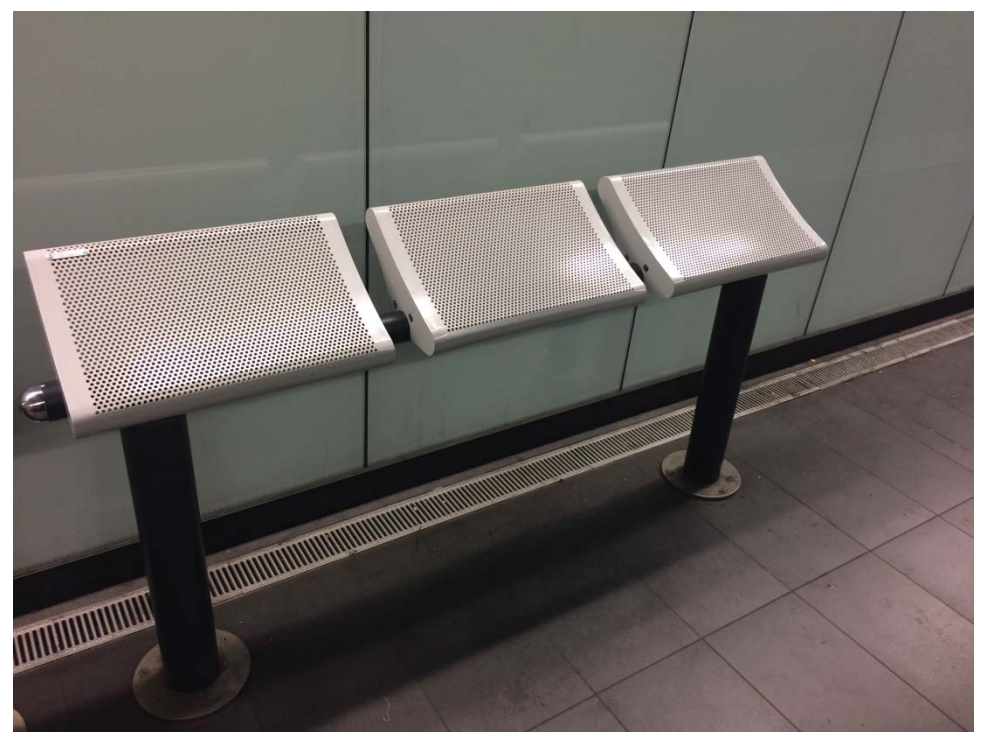
Figure 3- Modified seating prevents users from lying down (Rome, Italy).