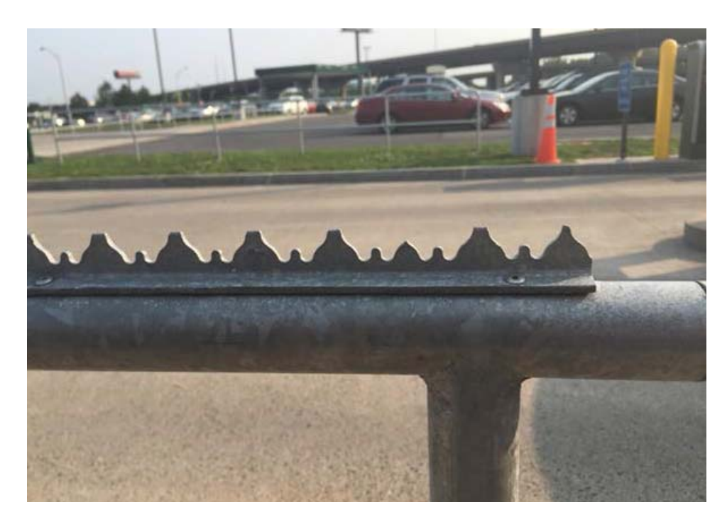
Figure 4- Anti-skate elements added to railing to deter skateboarders (Syracuse, USA).