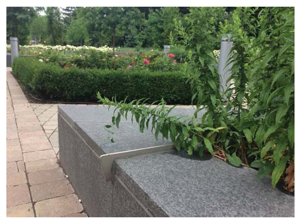
Figure 8- Skateboard deterrents (Gibson Park, North York). Photo by author.