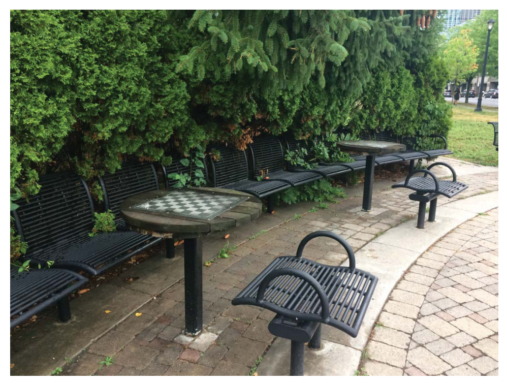
Figure 7- Specially designed seating (Gibson Park, North York).

The neighbouring Rose Garden, a small park, or parkette, was created as a Privately-Owned Publically Accessible Space (POPS). It directly faces Yonge Street and frames the entrance to Gibson Square. While privately owned and operated, there is an agreement with the City of Toronto that the space be open to public use (City of Toronto 2014). As part of this agreement, POPS are required to include signage that clearly identifies the space as publically accessible, but no clear signage is located on the site. CPTED principles are also integrated into the design of the Rose Garden with features like pedestrian level lighting and clear sightlines. In addition, natural surveillance is facilitated through active uses that border the space in the form of restaurant patios located at each end of the parkette. Placemaking elements like moveable tables and chairs are available for public use during designated times. In contrast, specially designed benches equipped with a centre bar line the entrance of the parkette, closest to the street (Figure 9). Finally, granite ledges that line the space are equipped with skateboard deterrents. Interestingly, these ledges are still being skateboarded upon, despite the presence of defensive architecture (Figure 10). This demonstrates how defensive urban design does not always work as intended and how people are adaptable and can circumvent inflexible design elements.