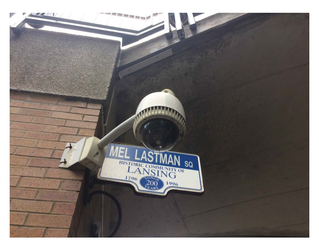
Figure 5- Visible signs of surveillance (Mel Lastman Square, North York).

Modified seating is also observed in Mel Lastman Square. While some benches in the square are traditional in form with a backrest and two armrests located at each end of the bench, other benches are modified with a centre bar. When asked about the modified benches, a City of Toronto urban designer revealed the centre bars are used "to mostly deter anyone from sleeping on the benches" (Personal Communication 04/18/2018) (Figure 6). The modified benches line the entrance of the square where visibility from the street is the highest, whereas traditionally designed benches are dispersed throughout the rest of the square. While the addition of centre bars on benches are often premised as an accessibility feature for seniors and people with disabilities, it can actually conflict with accessibility goals because people of different abilities and body sizes cannot fit comfortably between the bars. In a radio interview on AMI-audio, Kelly MacDonald, the host of Kelly and Company admits, "Even I know how much I've hurt myself when they started taking away the benches in the subway system. You go to sit on a chair and your cane touches it. You spin around to sit down, used to the old bench that was longer. Now you have a bar in your backside because you were expecting more open space" (MacDonald 2016). Moreover, the addition of centre armrests on benches can restrict the flexibility of the bench, limiting how many users it can accommodate and how they want to use it.