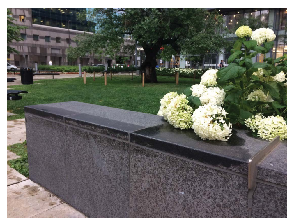
Figure 10- Undeterred skateboarders leave a black waxy residue on a defensive ledge (Rose Garden, North York).

regardless of their location within the city. Since Mel Lastman Square was designed and built before CPTED strategies were widely adopted throughout the city, it demonstrates how a public space can be adapted with defensive elements. This contrasts with nearby Gibson Park and Rose Garden which shows how CPTED strategies and defensive architecture are integrated into the design process, before any conflicts arise over spatial uses. While issues like homelessness are perceived to be concentrated in the city centre, the presence of modified and specially designed benches in North York's Mel Lastman Square, Gibson Park, and Rose Garden tell a different story. The benches, adapted to prevent people from lying down, target people who are homeless, where a bench is not only a place to rest, it is a part of their geography of survival. The anti-homeless benches in all three publically accessible spaces are located at the entrances, where visibility from the street is highest. This suggests the city is engaging in "street-level city image manipulation" (Atkinson 2003:1840).