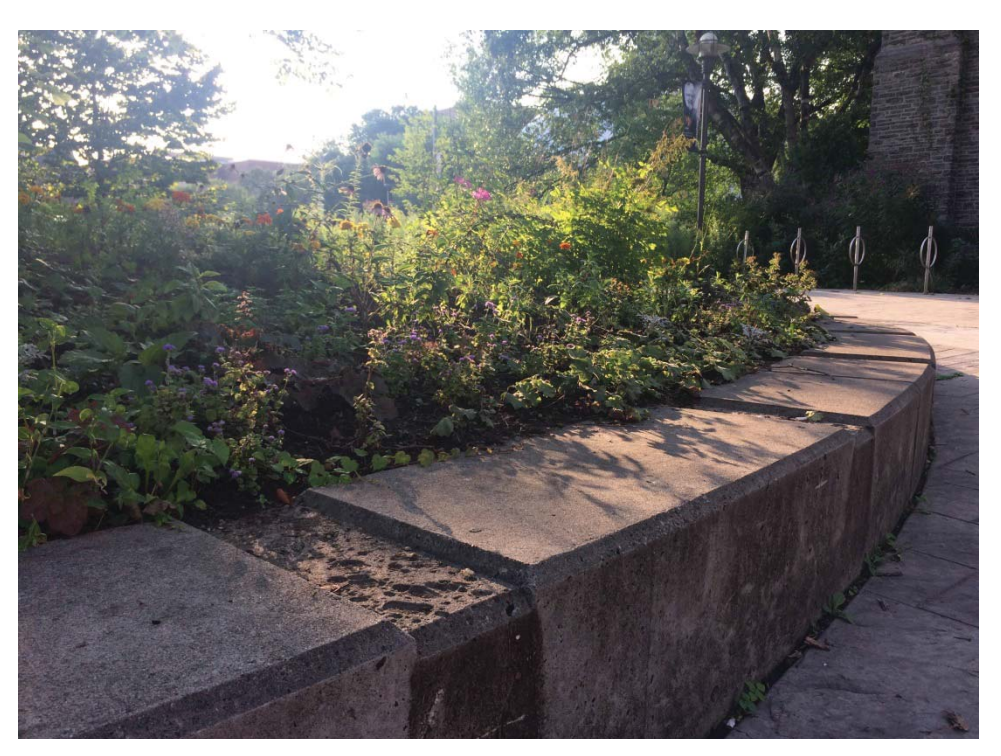
Figure 2- Defensive planter ledge designed to discourage skateboarding (Toronto, Canada).

forms do not discriminate against specific populations and are used to defend space against the general public, like fences or barriers that restrict access to space. This added complexity produces a variety a forms that does not fit neatly into bounded categories.