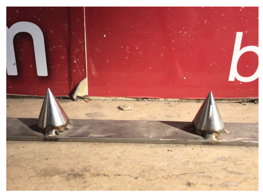
Figure 1- Inherently hostile anti-loitering spikes (Paris, France).